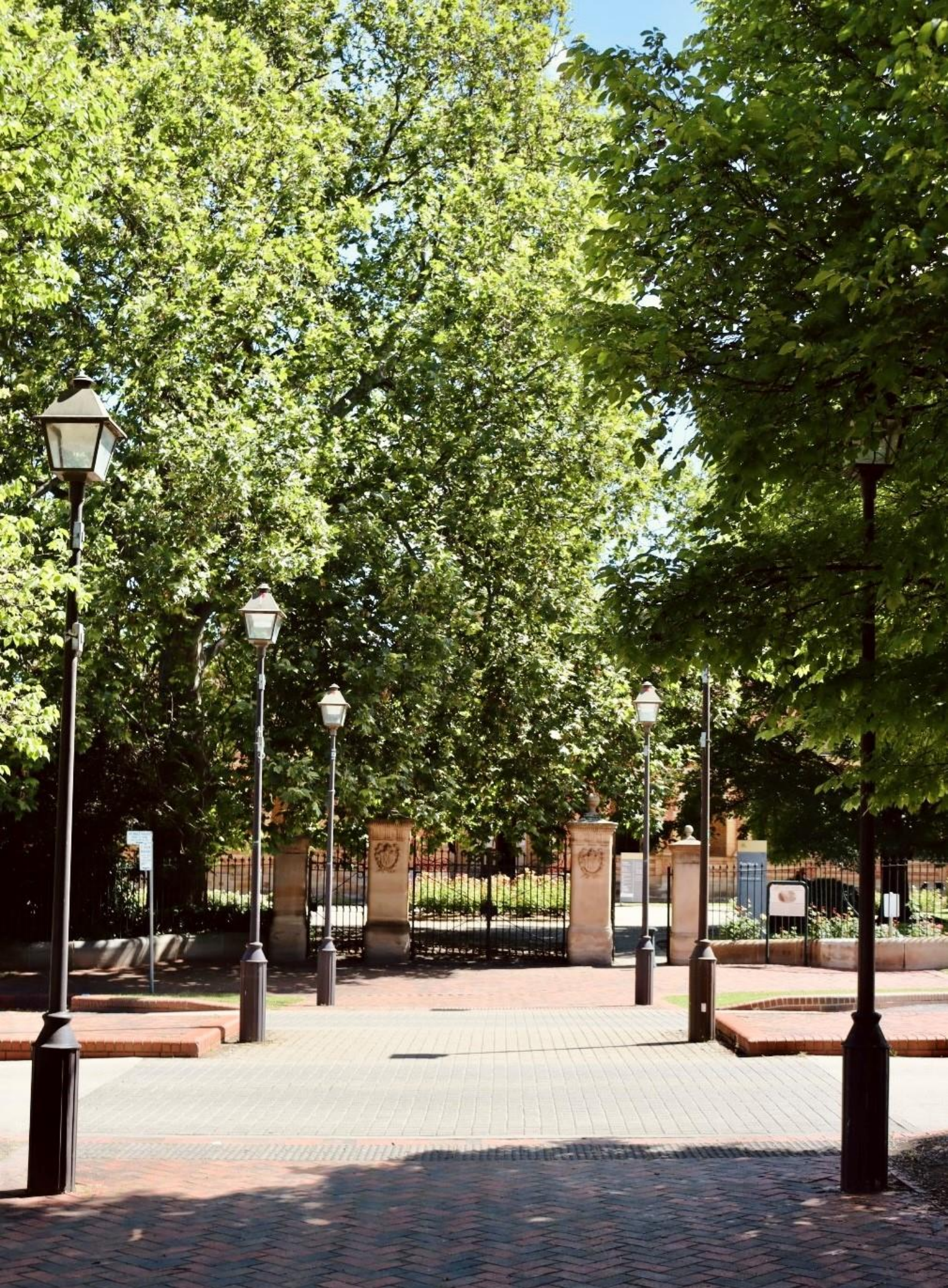
Belmore Park, looking towards Goulburn Courthouse.